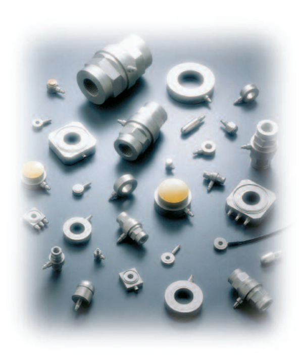
Dynamic Force Sensors